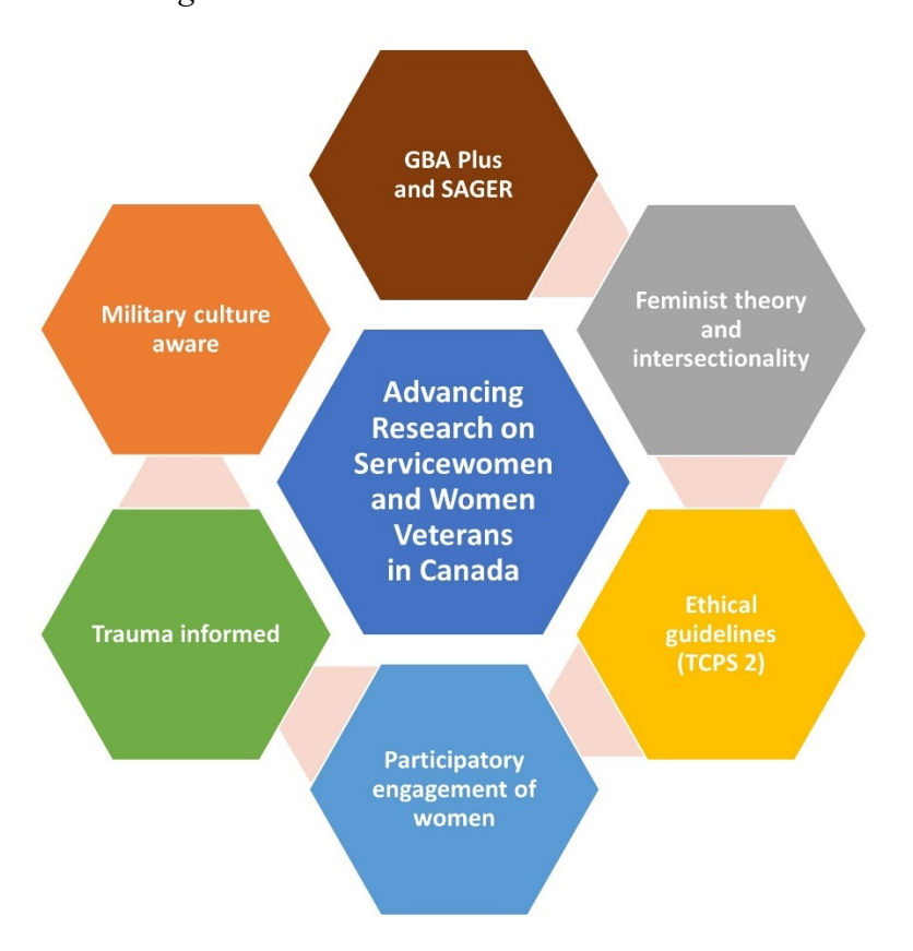
Figure 5 Best Practices for Conducting Research on Servicewomen and Women Veterans

As research interest in servicewomen and women Veterans increases in and beyond government, it is important to consider how this research is undertaken. Simply adding women to the way we have conducted military and Veteran research in the past—with its systemic sex and gender biases—is problematic and can potentially cause harm (Eichler, 2017). If researchers follow the dominant "add women and stir" type of approach, they are likely to continue using male-assumed questions without capturing the unique sex- and gender-specific experiences and needs of servicewomen and women Veterans. Below we outline best practices that should be followed when conducting research on servicewomen and women Veterans (see also Figure 5 ).