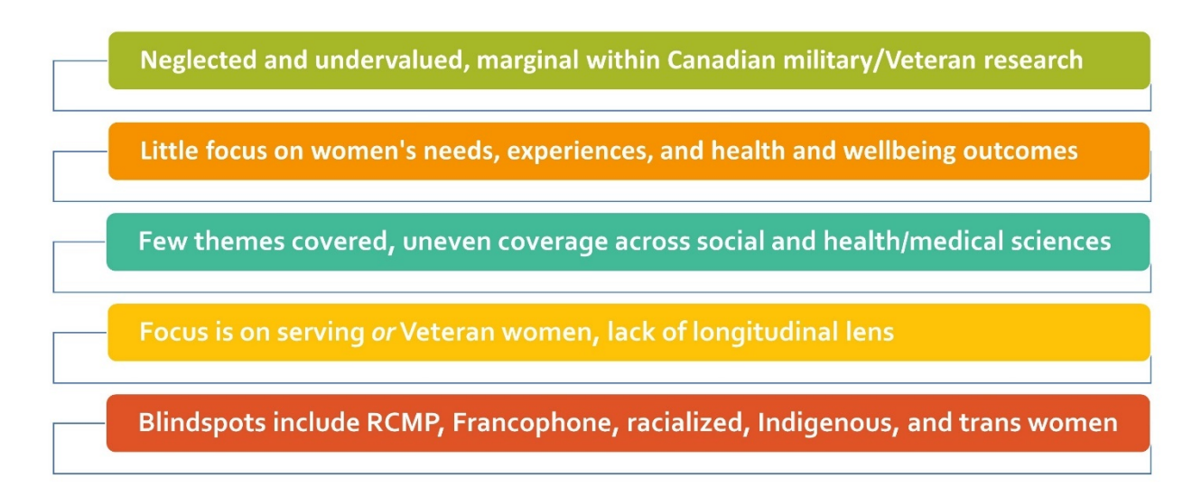
Figure 3 Select Key Characteristics of Canadian Research on Servicewomen and Women Veterans

How do we best understand why the field of servicewomen and women Veteran research is what it is in Canada? Below we discuss some of the reasons that explain why this has been a historically neglected, underdeveloped, and marginalized field of study within Canadian military and Veteran research (see also Figure 4 ).