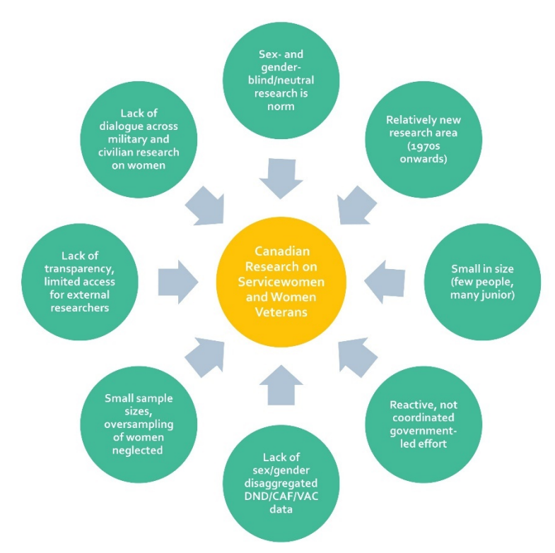
Figure 4 Reasons for Current State of Canadian Research on Servicewomen and Women Veterans