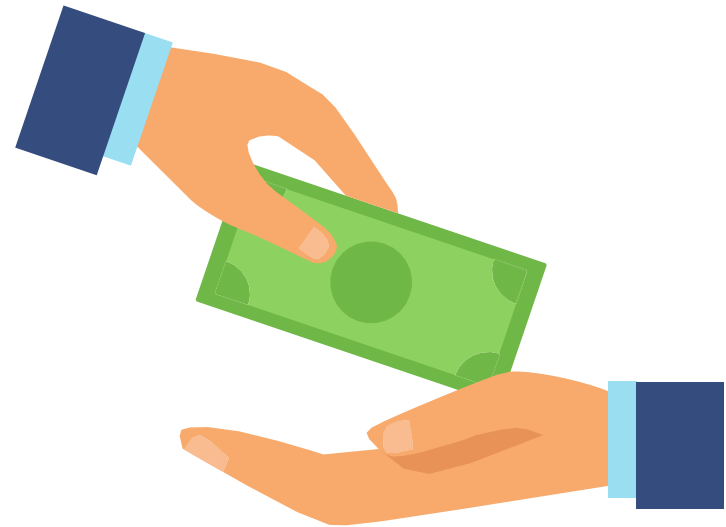
Out of pocket (oh no!)