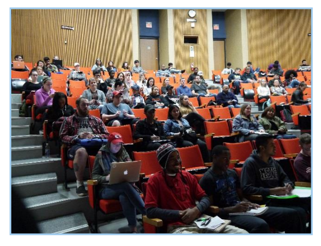
Career Panel Fall 2017 attendees

Tuesday, March 6 from 1:30 p.m. to 2:45 p.m. Seton Auditorium C