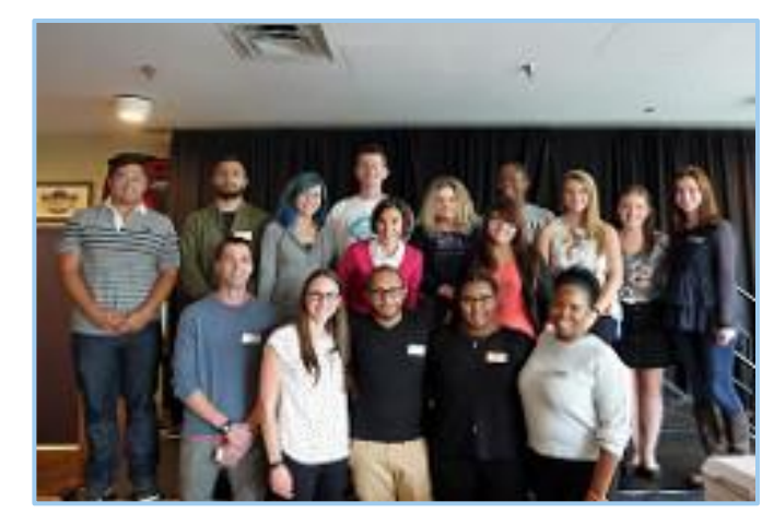
BTS at the 2017 Pizza Social