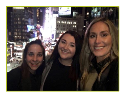
Students in Time Square, New York

In addition to the volunteer work, students attended a Broadway play, participated in group activities, and explored the city.