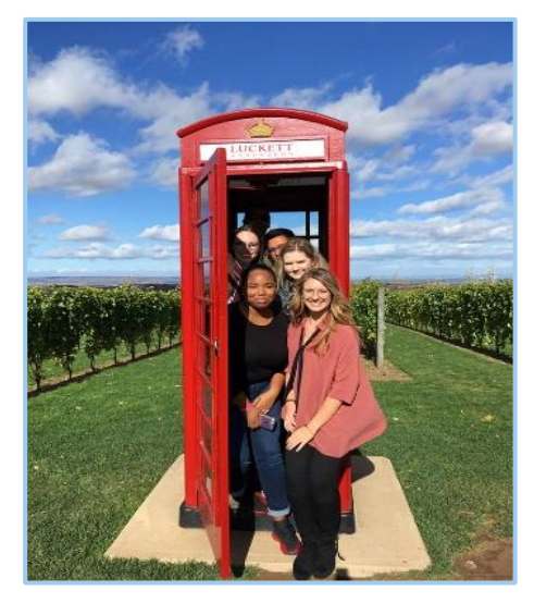
BTS on the 2017 Sustainable Business Tour

The BTS had a busy fall semester! The society hosted the annual BTS pizza social, played an active role in the Learners & Leaders Conference, held bake sales, and attended Halifax Chamber of Commerce events.