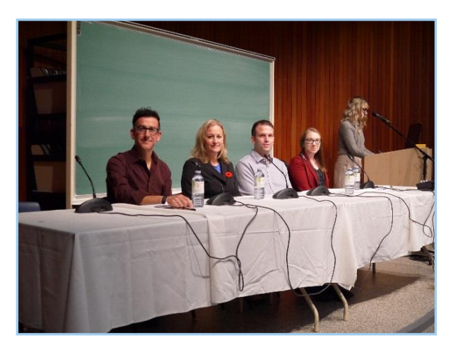
Tourism & Hospitality Management Panel Fall 2017