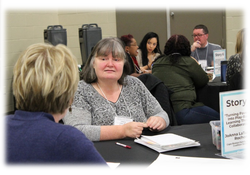
Turning Pavement into Play-Based Learning Through Collaboration

Reaching Back to Rise Above: Examining How Far We Have Come as People of African Ancestry and Seeing All Our Possibilities