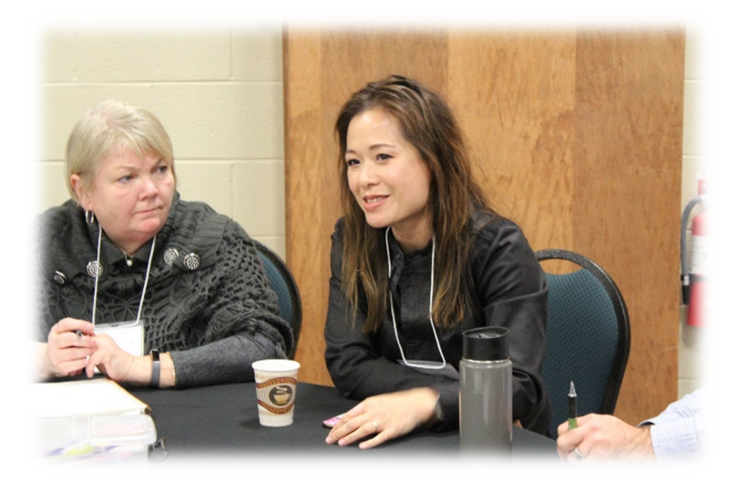
Walking a Tightrope Between Research and Community-Based Practice: Bridging Interests in a Shifting System