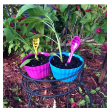
Community Garden at the Ice cream Social!