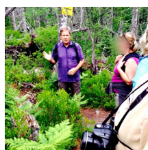
Take a hike! Our trip back to Susie's Lake Wilderness area