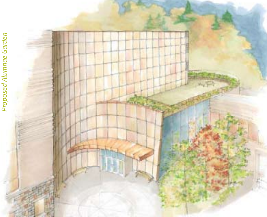
Proposed Alumnae Garden

Building Tomorrow Together , is a $16 million capital campaign, and only the third capital campaign in the Mount's 135-year history.