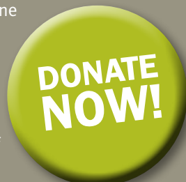
Our Donors directed their funds to the following...

We are very pleased to announce that we are once again able to offer secure online giving. This option offers alumnae and friends the option to make a gift or pledge payment directly online using a simple, secure form. It's as easy as clicking on the 'donate now' button on our website. Your gift will be processed promptly by University Advancement staff and a tax receipt issued.