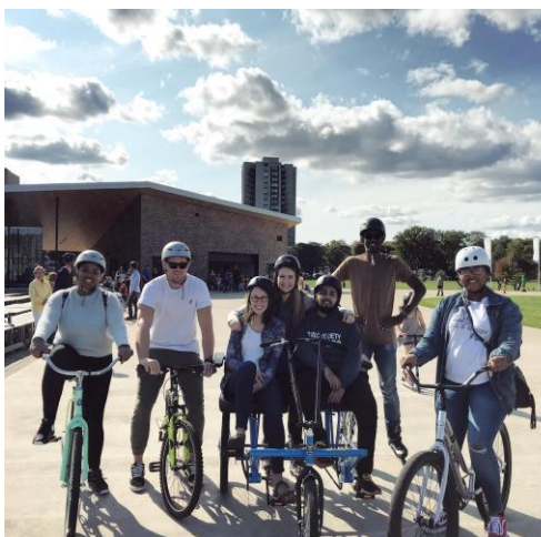
BTS biking and rollerblading social at the Emera Oval, 2018

See the BTS webpage or Facebook for instructions on how to apply!