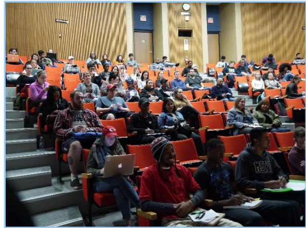
Career Panel Fall 2017 attendees

Find your career inspiration from industry experts at Career Week!