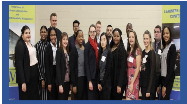
BTS at the 44 th annual Learners and Leaders Conference

For more information visit: Learning Passport Moodle site http://msvu.ca/learningpassport