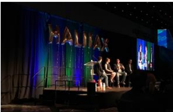
Halifax Chamber of Commerce Annual Fall Dinner