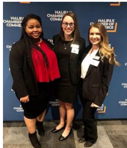
Students attending Halifax Chamber of Commerce Annual Fall Dinner

Learn more about the Halifax Chamber of Commerce by visiting: http://halifaxchamber.com/