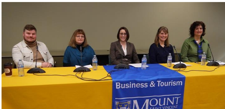
Tourism and Hospitality Management Panel, Fall 2018

Wednesday, November 6 th from 1:30 p.m. to 2:45 p.m.