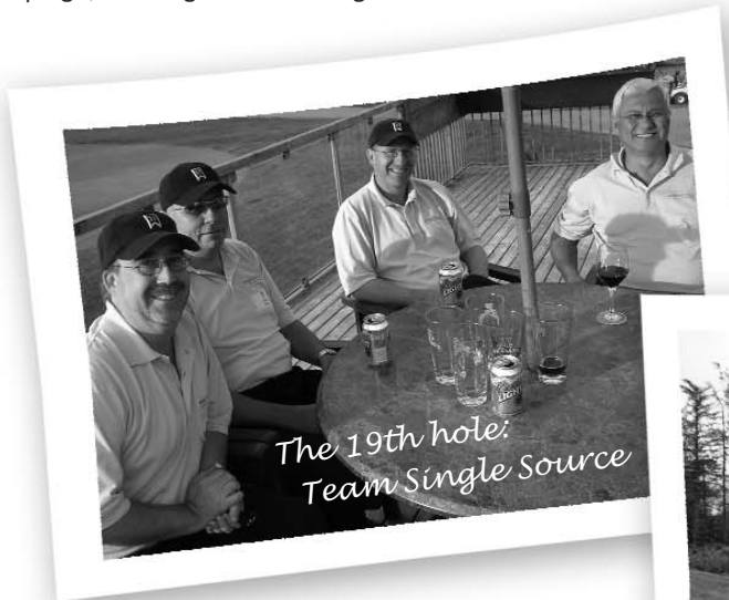
The 19th hole: Team Single Source