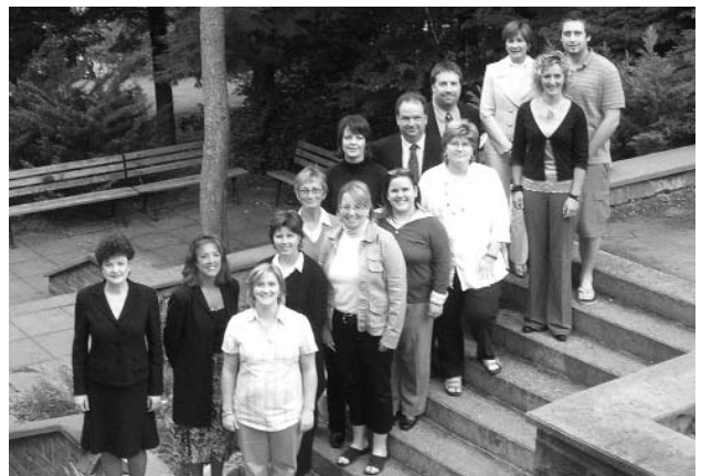
MSVAA Board of Directors 2006-07