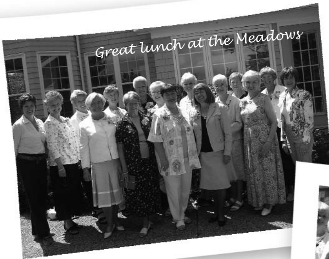
Class of 1956

A wonderful, fulfilling weekend left the group eager to meet again in five years.