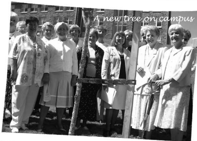
Class of 1956