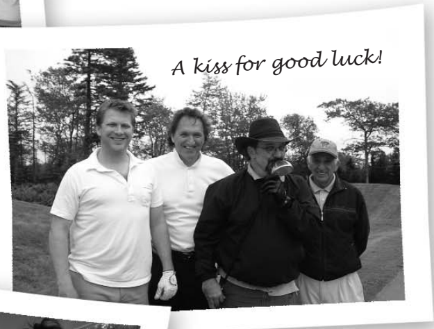
A kiss for good luck!