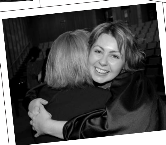
Hugs all round