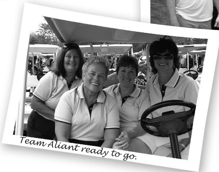
Team Aliant ready to go.