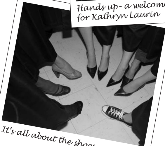
It's all about the shoes.