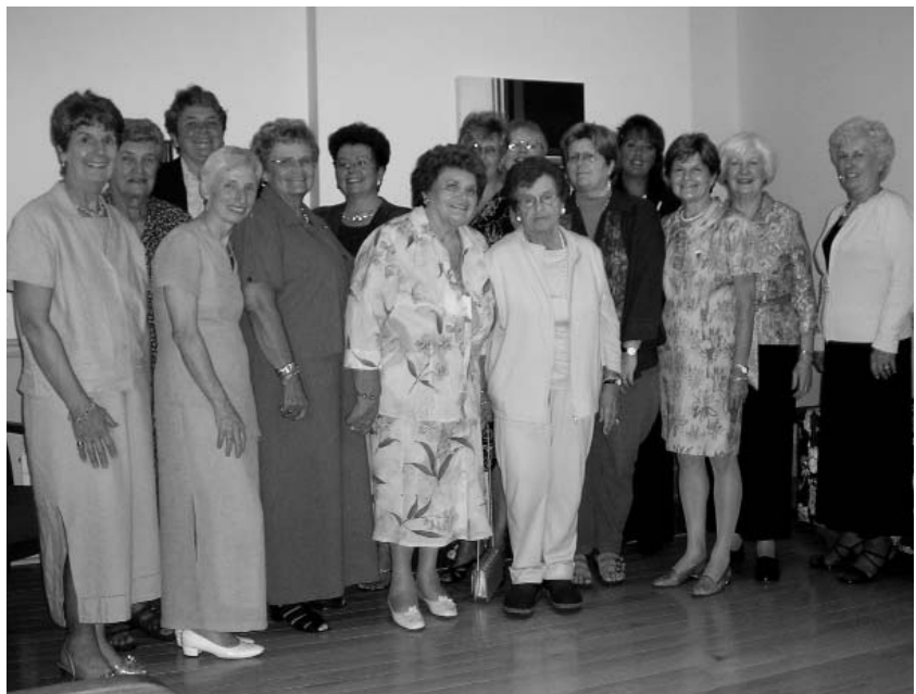
Past Presidents of the MSVAA share an evening of laughter at The Meadows.