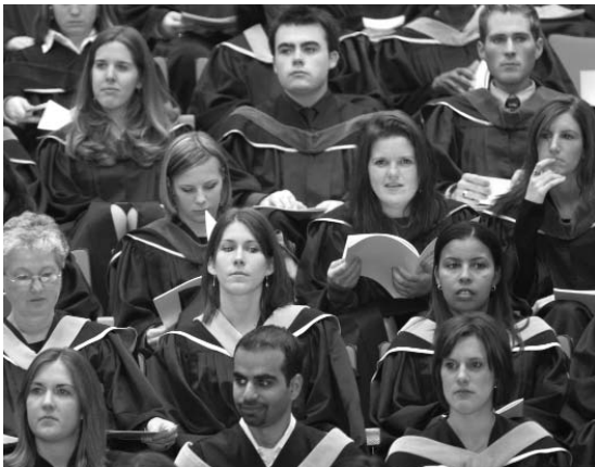
October 23, 2005 marked Fall Convocation on campus. More than 350 students received certificates, diplomas and degrees in 34 programs. Congratulations to the Class of 2005.