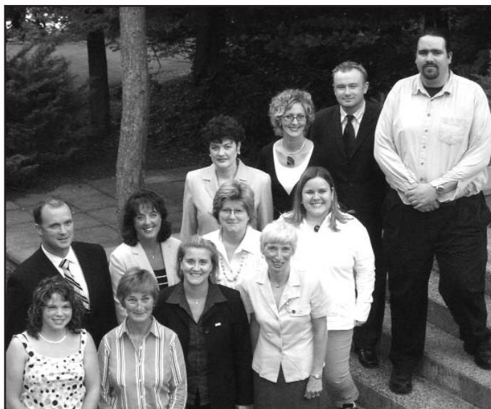
MSVAA Board of Directors 2005-06