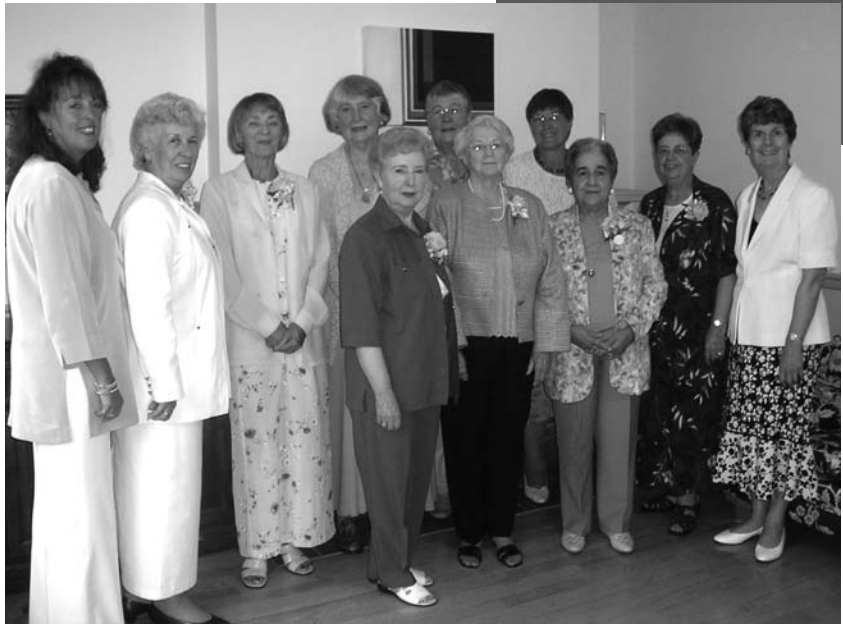
MSV Academy and college grads gather at The Meadows for the 50th Class Anniversary Luncheon.

Whether it was golf, good food or great conversation, an unforgettable time was had by all.