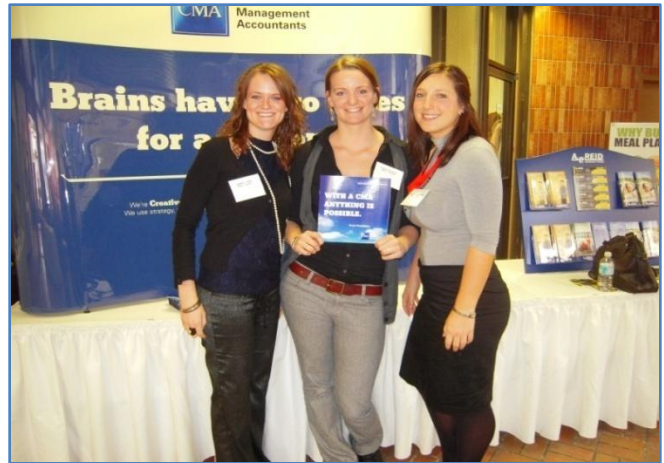
Mount students visit exhibitor booths at the 35 th Annual Business and Tourism Conference and Dinner on February 4, 2010.

We look forward to seeing you at our first event early in the semester!