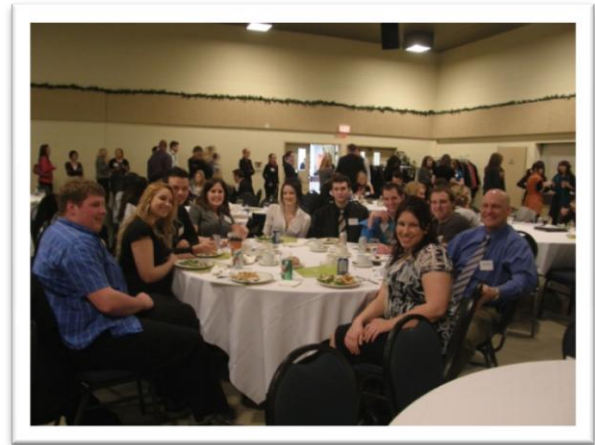
Friends and colleagues from NSCC enjoyed themselves at last year's Business and Tourism Conference.

The conference is the most anticipated event of the year for the Dept. of Business and Tourism and we expect over 300 students, faculty and business people, from the business community, the Mount, NSCC and NBCC to be in attendance. This conference is noted for being such a great experience for students and the business community alike for networking and learning. Don't miss it!