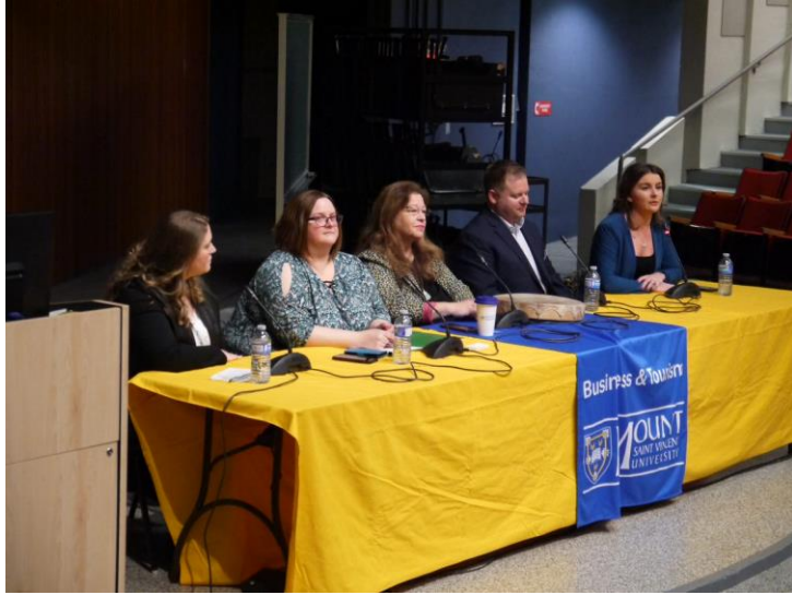
Image description: Career Week Panelists talking to students, Career Week 2022

Community Leadership Panel, Seton 553 Monday, October 31st 12:00 p.m. - 1:15 p.m.