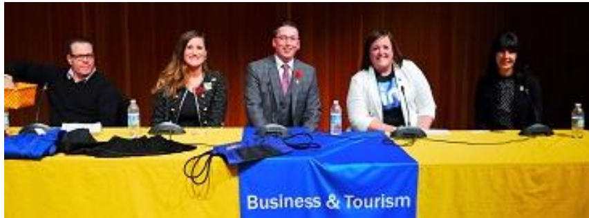
Marketing Panel, October 31, 2019

The Department of Business and Tourism is excited to host the annual fall Career Week online November 2 nd to November 5 th , 2020 . During Career Week, industry professionals will speak and provide professional advice to students during the virtual panels.