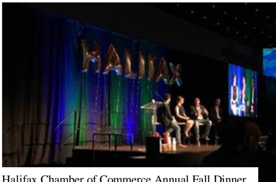
Halifax Chamber of Commerce Annual Fall Dinner