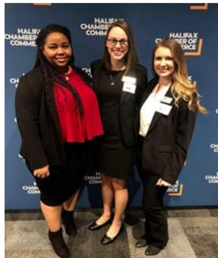
Students attending Halifax Chamber of Commerce Annual Fall Dinner