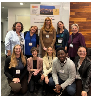
ARC LTC team members at CAG2025 in Montreal, where 5 presentations from the project were given.

Since last fall, there were 14 presentations at various conferences and events aimed at national, regional and local audiences. In 2026, the team will be at eight conferences, covering a range of disciplines and professional groups, with 11 presentations. To date more than 20 papers have been submitted for publication or are in development.