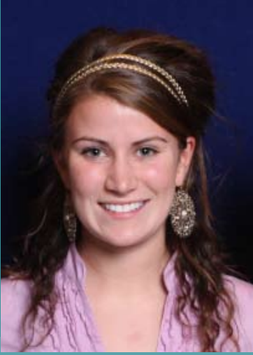
SCIENCE STUDENT. VARSITY ATHLETE. PRESIDENT'S SCHOLAR.